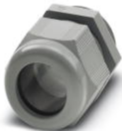
Cable gland, cable gland material: PA, external cable diameter 19 mm ... 28 mm, shielding: no, connecting thread: M40 x 1.5, color: silver-gray RAL 7001

Please be informed that the data shown in this PDF Document is generated from our Online Catalog. Please find the complete data in the user's documentation. Our General Terms of Use for Downloads are valid ( http://phoenixcontact.com/download )