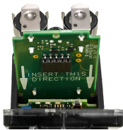
Figure 1: Q45 battery board

As with all batteries, these are fire, explosion, and severe burn hazards. Do not burn or expose them to high temperatures. Do not recharge, crush, disassemble, or expose the contents to water. Properly dispose of used batteries according to local regulations by taking it to a hazardous waste collection site, an e-waste disposal center, or another facility qualified to accept lithium batteries.