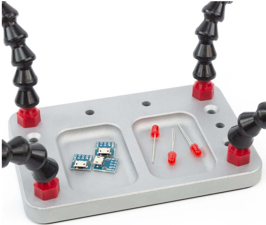
Built-in Parts Trays