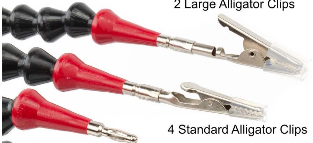
2 Large Alligator Clips