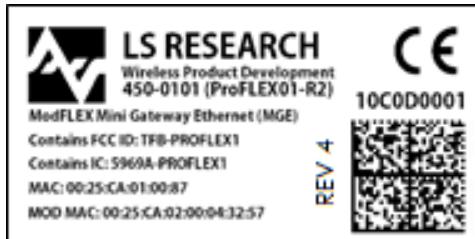
Part Number 450-0101, MGE