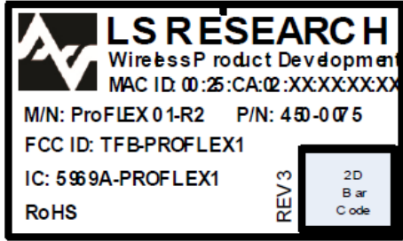
Part Number 450-0075