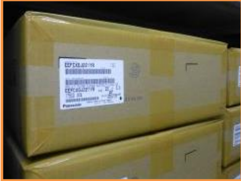
【SP-Cap Box label】