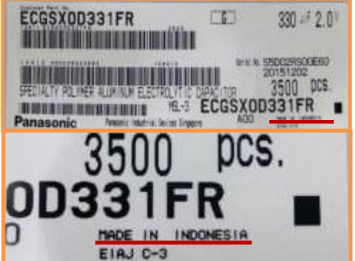
【SP-Cap AL-bag label】