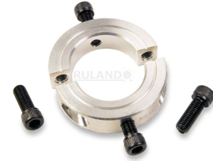
*Additional hardware NOT included