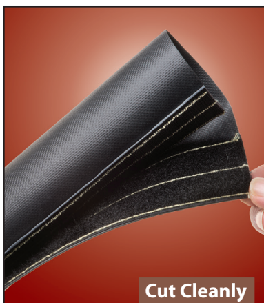
Cut Cleanly Scissor