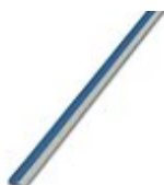
Continuous plug-in bridge, length: 500 mm, color: blue

Continuous plug-in bridge - FBST 500-PLC BU - 2966692