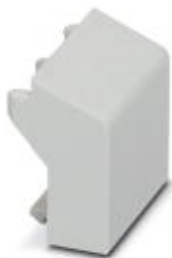
DIN rail housing, Filler plug for unoccupied terminal points, color: light gray (7035)

Please be informed that the data shown in this PDF Document is generated from our Online Catalog. Please find the complete data in the user's documentation. Our General Terms of Use for Downloads are valid ( http://phoenixcontact.com/download )