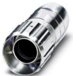
Sleeve housing for cable connector, straight, Bayonet locking, M23, shielded: yes, cable diameter range: 2 mm ... 14.5 mm

Please be informed that the data shown in this PDF Document is generated from our Online Catalog. Please find the complete data in the user's documentation. Our General Terms of Use for Downloads are valid ( http://phoenixcontact.com/download )