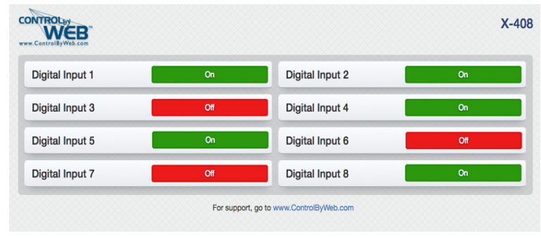
Example Control Page