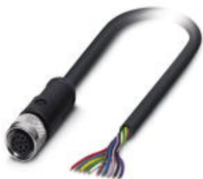
Master cable, 12-position, PUR/PVC, black RAL 9005, free cable end, on Socket straight M12, A-coded, cable length: 10 m

Please be informed that the data shown in this PDF Document is generated from our Online Catalog. Please find the complete data in the user's documentation. Our General Terms of Use for Downloads are valid ( http://phoenixcontact.com/download )