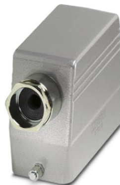
Figure shows product variant with screw connection.

http://eshop.phoenixcontact.de/phoenix/treeViewClick.do?UID=1677746