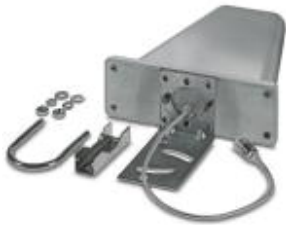
Directional antenna, outdoor installation, gain 8 dBi, connection N (female)

Please be informed that the data shown in this PDF Document is generated from our Online Catalog. Please find the complete data in the user's documentation. Our General Terms of Use for Downloads are valid ( http://phoenixcontact.com/download )