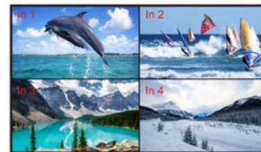
HDMI Monitor or TV