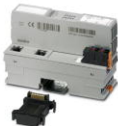
Axioline F, Bus coupler, Modbus/TCP(UDP), RJ45 socket, transmission speed in the local bus: 100 Mbps, degree of protection: IP20, including bus base module and Axioline F connector

Please be informed that the data shown in this PDF Document is generated from our Online Catalog. Please find the complete data in the user's documentation. Our General Terms of Use for Downloads are valid ( http://phoenixcontact.com/download )