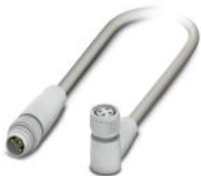
Sensor/actuator cable, 3-position, PP-EPDM halogen-free, gray RAL 7035, Plug straight M8, on Socket angled M8, with 2 LEDs, cable length: 1.5 m, Hygienic design, with plastic knurl

Please be informed that the data shown in this PDF Document is generated from our Online Catalog. Please find the complete data in the user's documentation. Our General Terms of Use for Downloads are valid ( http://phoenixcontact.com/download )