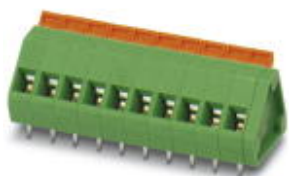
The figure shows the 10-position version

PCB terminal block, nominal current: 16 A, pitch: 5.08 mm, number of positions: 7, connection method: Spring-cage connection, mounting: Wave soldering, conductor/PCB connection direction: 45 °, color: green