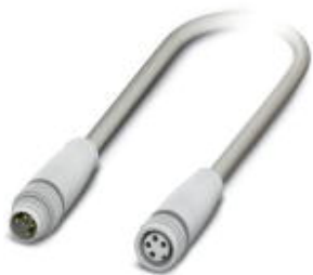
Sensor/actuator cable, 4-position, PP-EPDM halogen-free, gray RAL 7035, Plug straight M8, on Socket straight M8, cable length: 0.6 m, Hygienic design, with plastic knurl

Please be informed that the data shown in this PDF Document is generated from our Online Catalog. Please find the complete data in the user's documentation. Our General Terms of Use for Downloads are valid ( http://phoenixcontact.com/download )