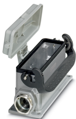
Box mounting base, with single locking latch, height 67 mm, with screw connection, 1x Pg21, with protective covers

Please be informed that the data shown in this PDF Document is generated from our Online Catalog. Please find the complete data in the user's documentation. Our General Terms of Use for Downloads are valid ( http://phoenixcontact.com/download )