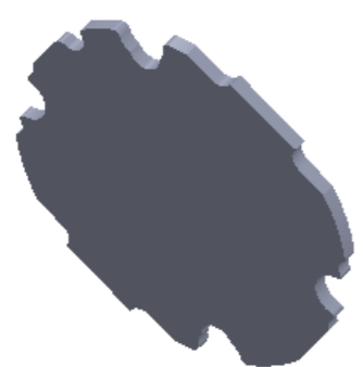
3D View Scale:- 2:1