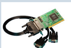
UC-253 LP uPCI 2xRS232