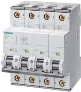
Miniature circuit breaker 400 V 10kA, 4-pole, C, 6 A, D=70 mm