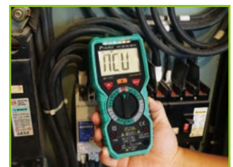
Non contact voltage detector