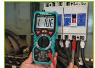
Live wire test