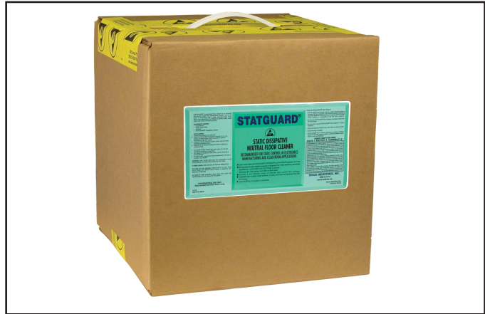
Figure 7. Statguard® Dissipative Floor Cleaner: 5 gallon bag-in-box

Statguard® Dissipative Floor Cleaner is formulated with dissipative agents that will rejuvenate and improve the static dissipative properties of floors treated with Statguard® Low-VOC Floor Finish. Statguard® Dissipative Cleaner effectively cleans without leaving behind any harmful residue that can dull the surface or impede dissipation properties. Statguard® Floor Cleaner is a non-alkaline detergent with a neutral pH, which requires no rinsing. Use the following procedure to clean treated floors with Statguard® Floor Cleaner. This product is also recommended for use on conductive floor tile and epoxy.