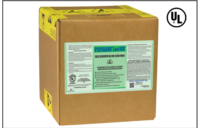
Figure 5. Statguard® Low-VOC Dissipative Floor Finish: 5 gallon bag-in-box

Due to the high percent solids of Statguard® Low-VOC Floor Finish (23%) it is recommended that two coats be applied in the initial application. In high traffic applications three coats may be required (do not apply more than two coats in 24 hours unless humidity is greater than 30%). Two coats of Statguard® Low-VOC 23% solids finish is similar to three coats of an 18% solids finish and three is equivalent to four coats of 18% solids finish.