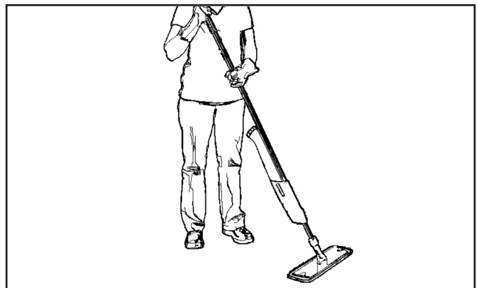
Figure 6. Applying floor finish with Flat Mop (optional)