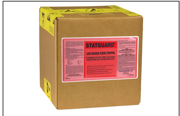
Figure 3. Statguard® Floor Stripper: 5 gallon bag-in-box

Stripping the floor is recommended for first time application of any finish. New tiles are supplied with a protective factory finish that protects during installation but should be stripped away prior to any floor finish application. Properly maintained floors should be stripped one to two times annually, depending on traffic and buildup of contaminated finish. Statguard® Floor Stripper is recommended to strip multiple layers of floor finish or coatings.