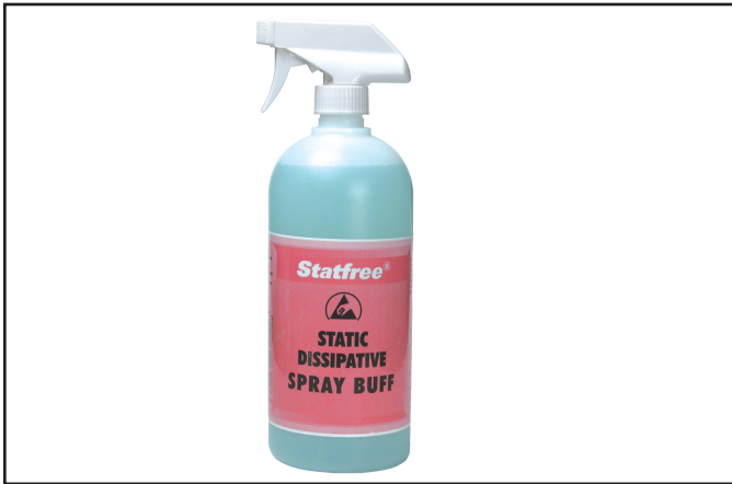
Figure 8. Statfree® Dissipative Spray Buff

Regular spray buffing will help to maintain floors treated with Statfree® Dissipative Spray Buff at peak performance and appearance. Spray buffing with Statfree® Dissipative Spray Buff will remove light surface soil while reviving the electrical properties of the treated surface.