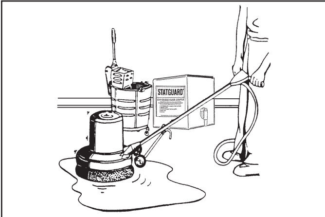
Figure 4. Stripping floor