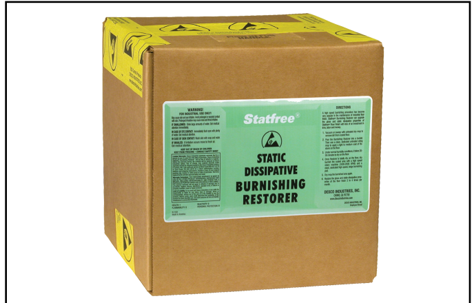
Figure 10. Statfree® Dissipative Burnishing Restorer

Statfree® Burnishing Restorer is a ready to use formulation that renews the unique protective properties and gloss of Statguard® Low-VOC Floor Finish with less of an investment in time, effort and money. Static decay properties, surface resistance characteristics and durability of the floor finish can be extended dramatically. The Restorer extends the re-coat cycle and significantly reduces the cost of maintenance.