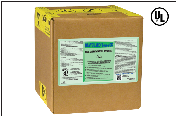
Figure 1. Statguard® Low-VOC Dissipative Floor Finish: 5 gallon bag-in-box