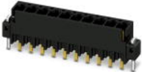
The figure shows the 10-position version

PCB headers, nominal current: 6 A, number of positions: 15, pitch: 2.54 mm, color: black, contact surface: Gold, mounting: THR soldering, Fixed coding of the first position, can be combined with the FMC 0,5/...-ST-2,54 C1 connector