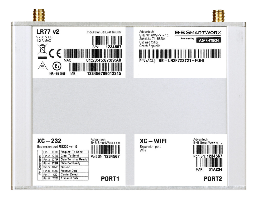
Figure 6: Example of labels on bottom of v2 metal router - from top left: Product label, Product Number label, PORT1 label (optional) and PORT2 label (optional).