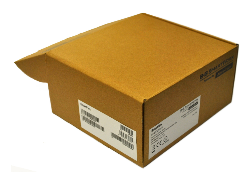
Figure 5: Example of divided cardboard box labels, placement on the cardboard box.