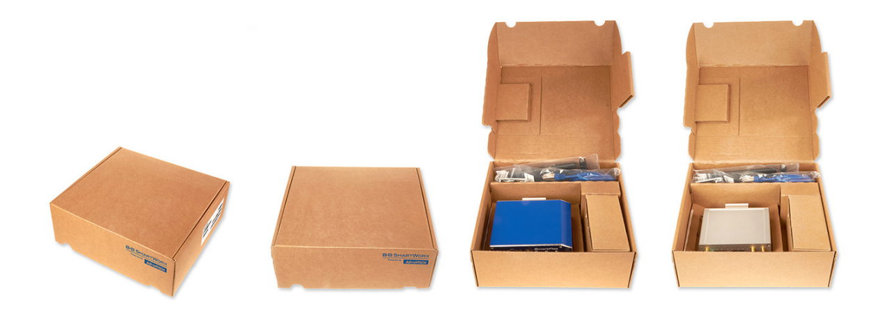
Figure 2: Views on set cardboard box – closed and open with v3 or v2 router with accessories.