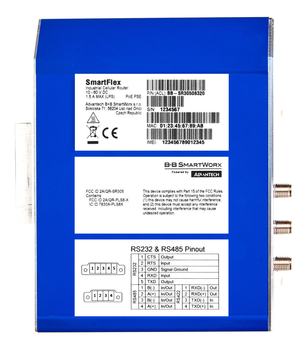
Figure 7: Example of labels on bottom of v3 metal router - from top: Product label, Certifications label (optional) and Interface label (optional).