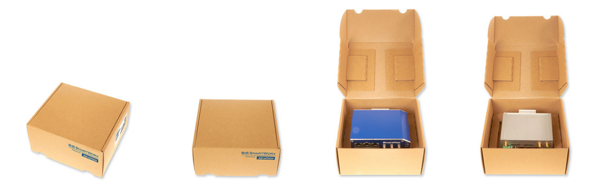
Figure 4: Views on router cardboard box – closed and open with v3 or v2 router only.