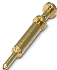
Crimp contact, turned, contact diameter: 1 mm, crimp range: 0.34 mm 2 ... 0.5 mm 2

Please be informed that the data shown in this PDF Document is generated from our Online Catalog. Please find the complete data in the user's documentation. Our General Terms of Use for Downloads are valid ( http://phoenixcontact.com/download )