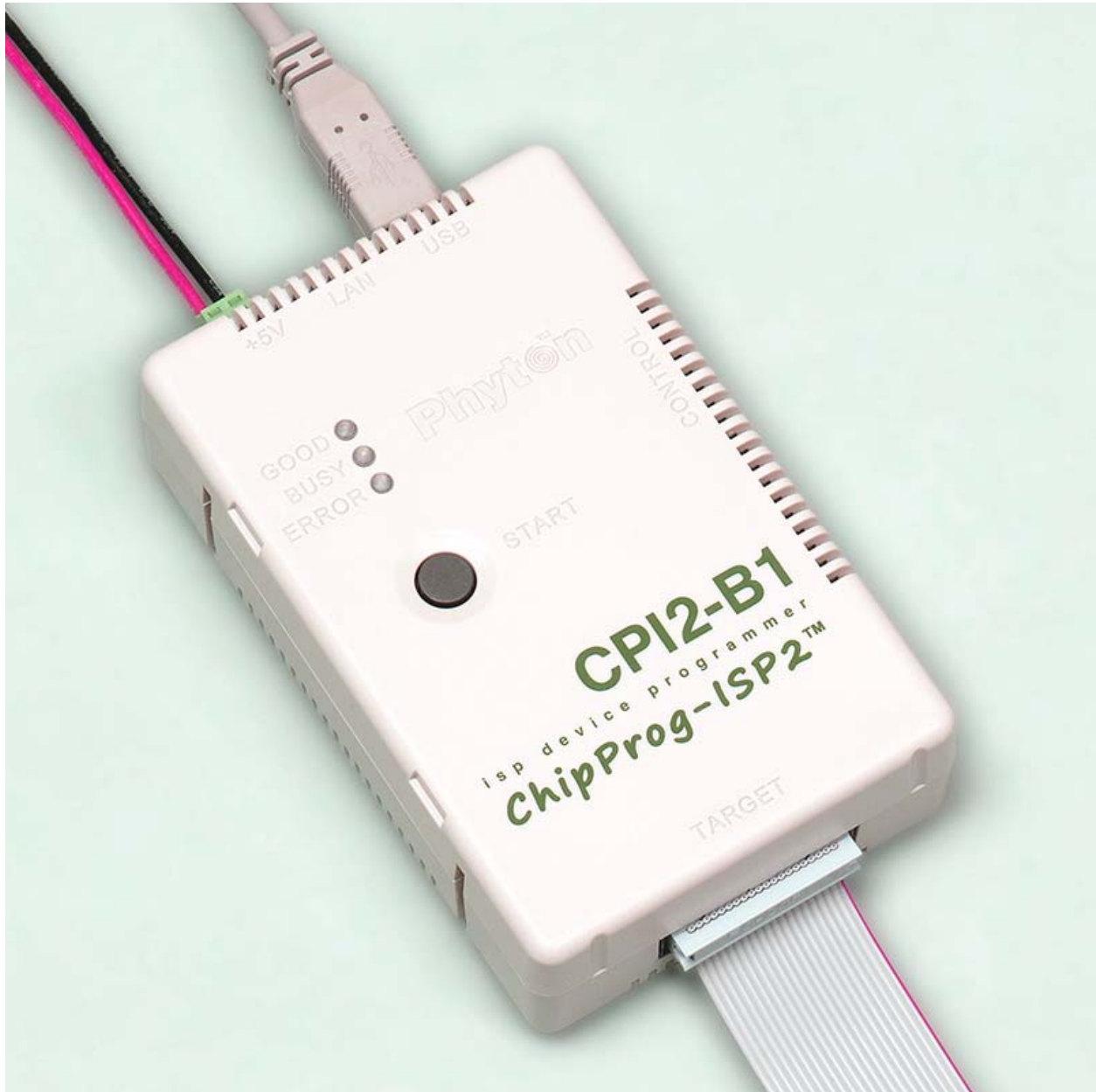
CPI2-B1-LTPLD – universal programmer