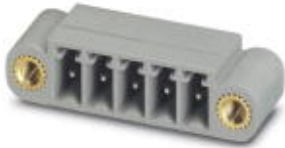
The figure shows the 5-pos. version of the product in gray

Header, Nominal current: 8 A, Rated voltage (III/2): 160 V, Number of positions: 8, Pitch: 3.5 mm, Color: pastel green, Contact surface: Tin, Mounting: Soldering