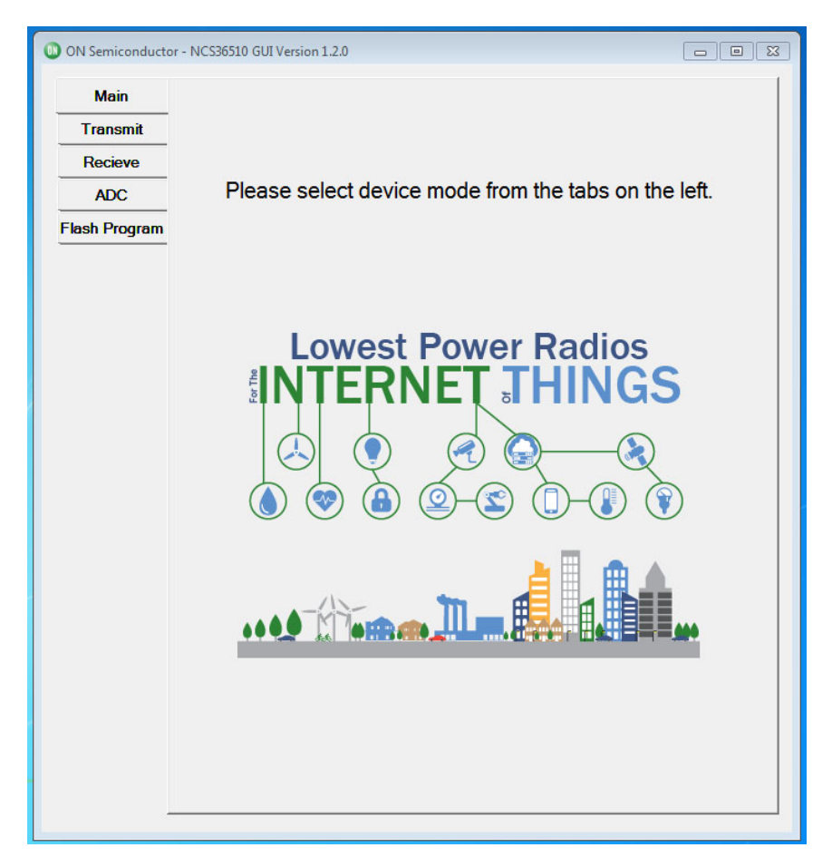
Figure 2. GUI Main Page

After opening the GUI please refer to sections "GUI Example – Receiver" through "GUI Example – FLASH Program" of this document for instructions on how to use the different operational modes of the NCS36510 supported by the GUI. The following figure depicts what to expect when the GUI starts.