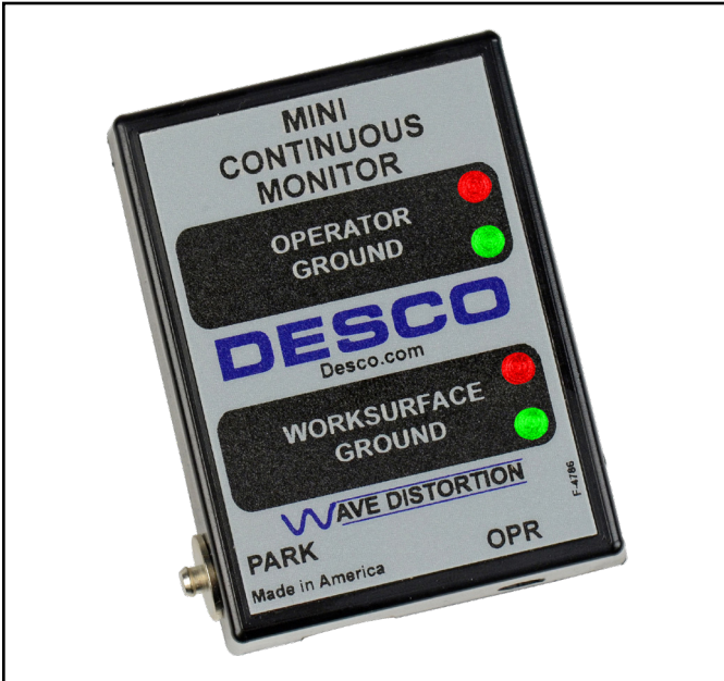
Figure 1. Desco Mini Monitor