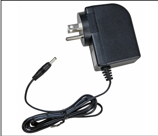
Figure 2. North American power adapter included with the 19239 and 19242 Mini Monitors