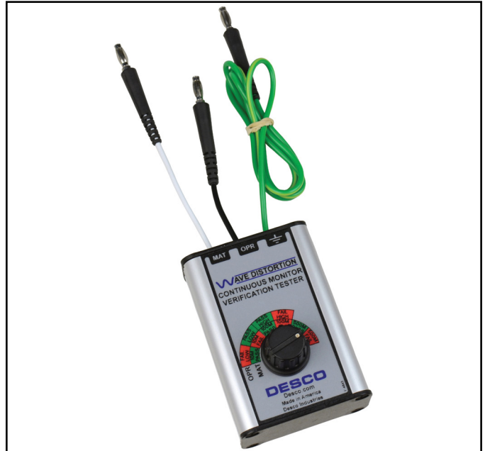
Figure 9. Desco 98221 Wave Distortion Monitor Verification Tester