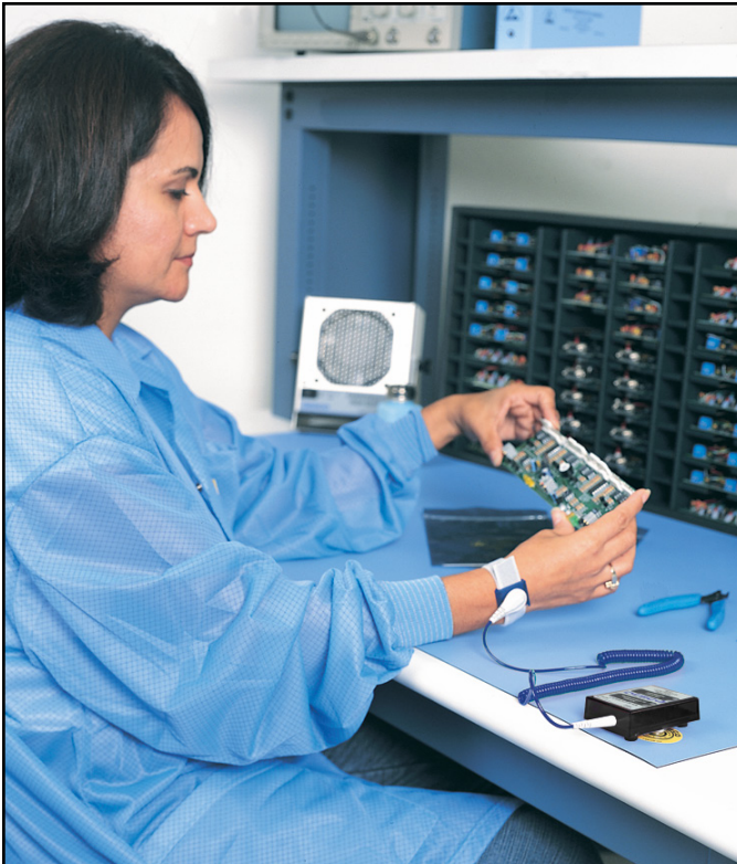
Figure 8. Using the Mini Monitor