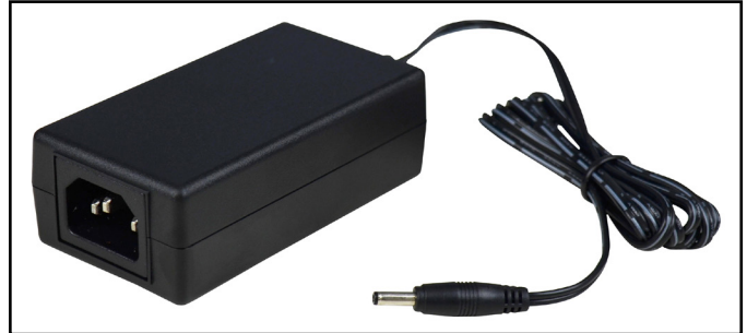
Figure 3. Universal power adapter included with the 19243 Mini Monitor

NOTE: The power cord must be purchased separately if ordering the 19243 Mini Monitor. The power cords are available as the following item numbers: