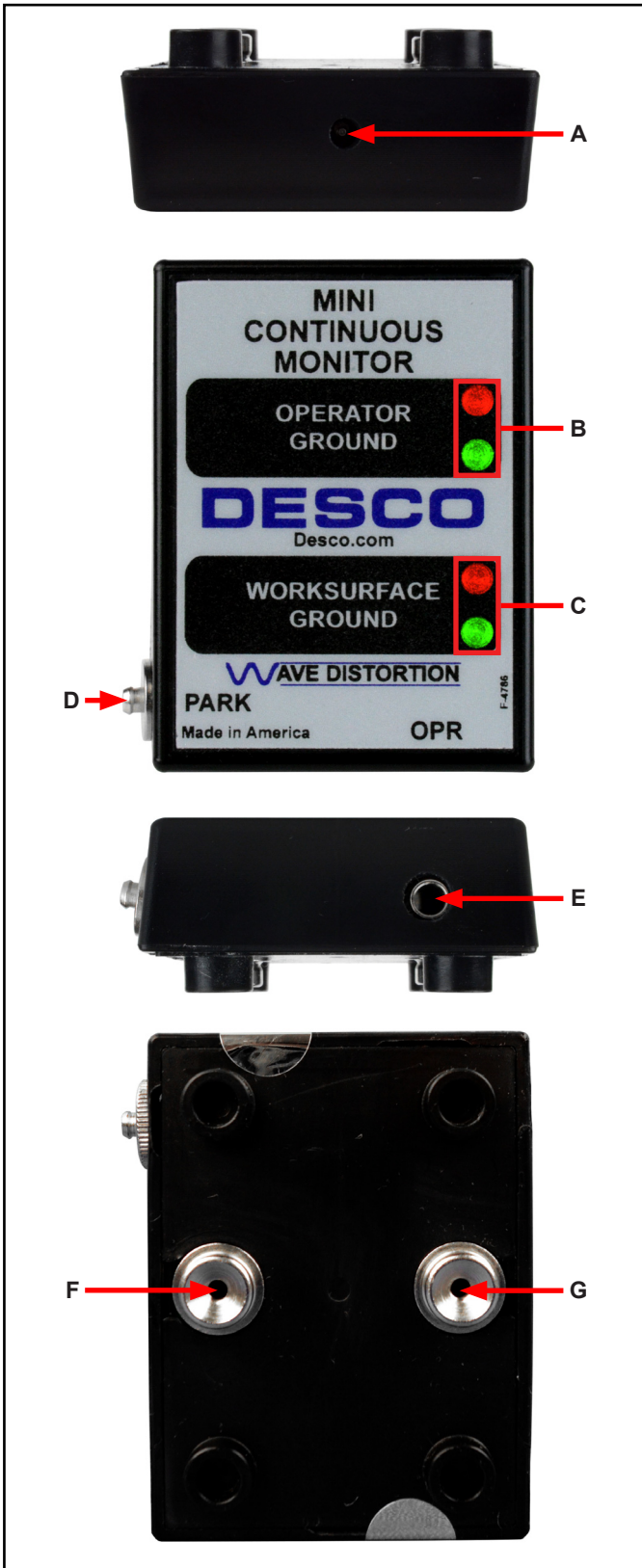
Figure 4. Mini Monitor features and components

A. Power Jack: Connect the included 24VDC power adapter here.