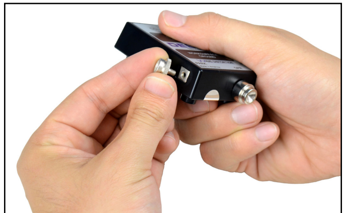
Figure 7. Changing the park snap on the 19243 Mini Monitor

The 19243 Mini Monitor includes an interchangeable 10mm park snap and 10mm banana jack adapter for operators who use wrist cords with 10mm terminations. Use the park snaps' knurled rims to unscrew the 4mm park snap from the monitor and install the 10mm park snap to the monitor. Plug the 10mm operator jack adapter into the monitor's operator jack.