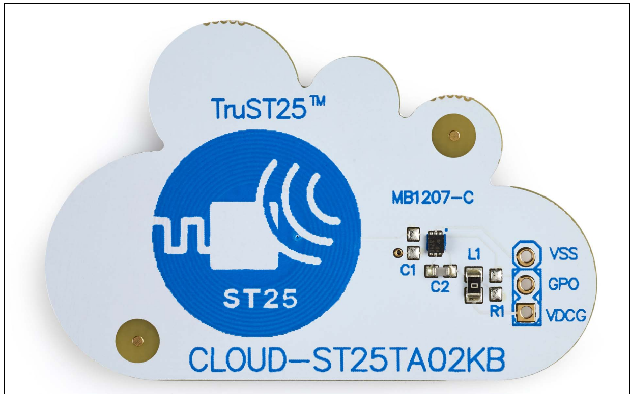
Figure 1. CLOUD-ST25TA02KB board (top view)