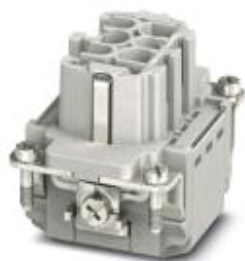
HEAVYCON socket insert, B6 series, 6 + PE-pos., push-in connection

Please be informed that the data shown in this PDF Document is generated from our Online Catalog. Please find the complete data in the user's documentation. Our General Terms of Use for Downloads are valid ( http://phoenixcontact.com/download )