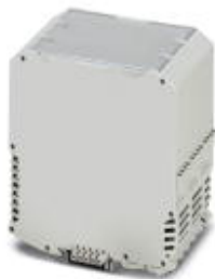
DIN rail housing, Complete housing with metal foot catch, tall design, with vents, width: 67.5 mm, color: light gray (7035)

Please be informed that the data shown in this PDF Document is generated from our Online Catalog. Please find the complete data in the user's documentation. Our General Terms of Use for Downloads are valid ( http://phoenixcontact.com/download )