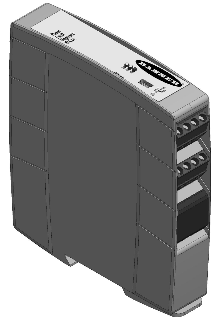
ISOMETRIC VIEW 1:1