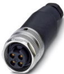
Connector, Universal, 4-position, Socket straight 7/8"-UNF, A-coded, Screw connection, knurl material: Zinc die-cast, nickel-plated, cable gland Pg9, external cable diameter 6 mm ... 8 mm

Please be informed that the data shown in this PDF Document is generated from our Online Catalog. Please find the complete data in the user's documentation. Our General Terms of Use for Downloads are valid ( http://phoenixcontact.com/download )