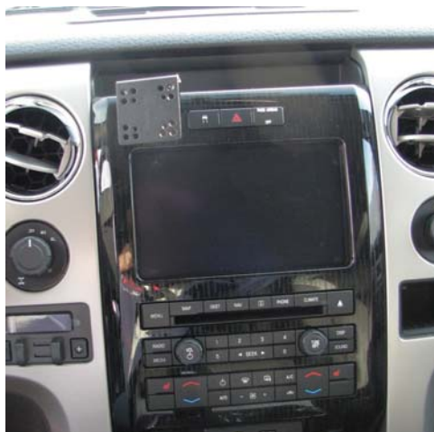
Mount in Place with Mounting Plate in Left Side Down Position on Nav.