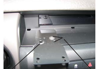
1" Screw Mounting Hole, 9/16"

INSTALLATION IS NOW COMPLETE. ENJOY YOUR NEW INDASH by PANAVISE MOUNT.