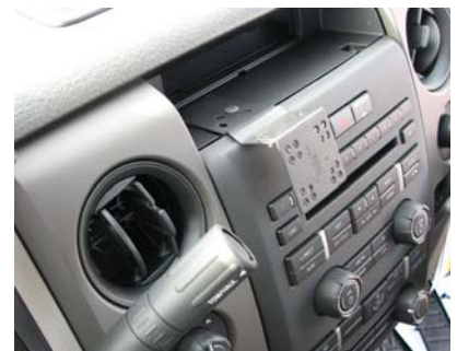
Mount in Place with Mounting Plate in Left Side Down Position