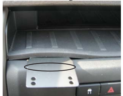
Rubber Mat Cut Area