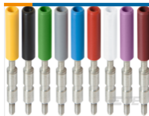
TE Part #1SNA179726R0200 AJS9