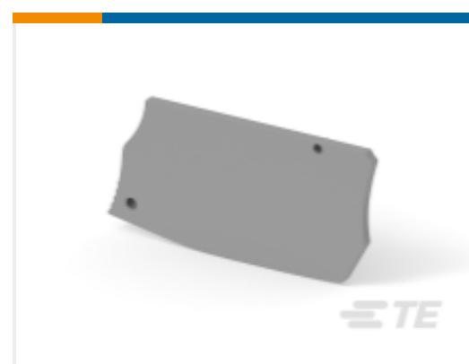
TE Part #1SNK505910R0000 ES4