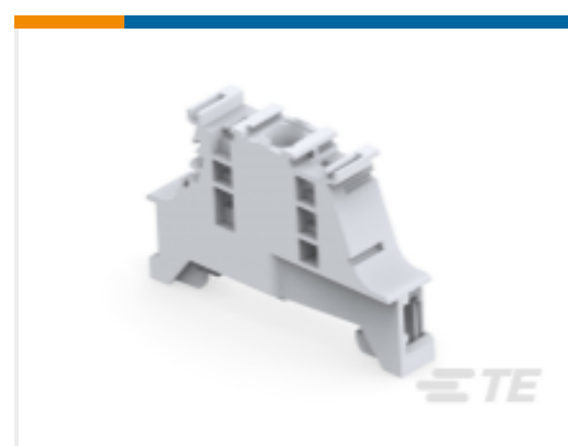
TE Part #1SNK900001R0000 BAM4