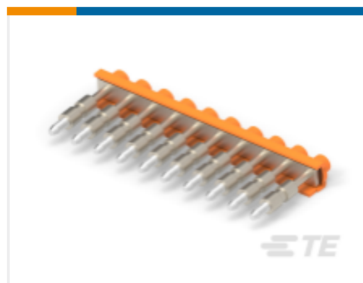
TE Part #1SNK908910R0000 JB8-10-R1