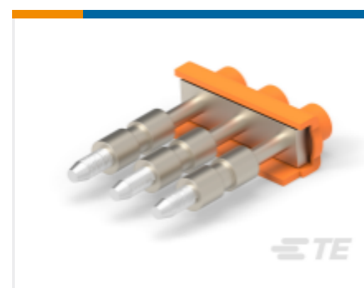
TE Part #1SNK908903R0000 JB8-3-R1