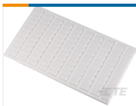
TE Part #1SNK169999R0000 MC812PA