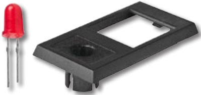
AT070 LED & AT208 Bezel will be Discontinued

2. NKK Switches will be discontinuing the AT208 Bezel and the AT070 LED in all colors for both standard and custom switches. These two accessories have been used in M Series Rockers, and EB, MB2400 and MB2500 Series Pushbuttons, all snap-in mount models. There are no direct alternates for the discontinued products. Part numbers for effected standard accessories are on the following table.