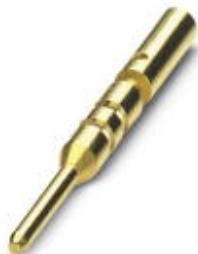
Crimp contact, turned, contact diameter: 0.8 mm, crimp range: 0.34 mm 2 ... 0.5 mm 2

Please be informed that the data shown in this PDF Document is generated from our Online Catalog. Please find the complete data in the user's documentation. Our General Terms of Use for Downloads are valid ( http://phoenixcontact.com/download )