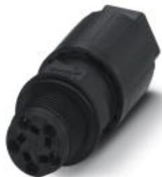
QUICKON panel feed-through, black, 4+PE-pos., 1.0 mm 2 ... 2.5 mm 2 /690 V/20 A, with QUICKON nut, for cable diameter of 9 mm ... 16 mm, with push-in spring-cage connection.

Please be informed that the data shown in this PDF Document is generated from our Online Catalog. Please find the complete data in the user's documentation. Our General Terms of Use for Downloads are valid ( http://phoenixcontact.com/download )