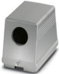
HEAVYCON sleeve housing B48, for single locking latch, height 96 mm, with thread 1x M50, lateral conductor exit

Please be informed that the data shown in this PDF Document is generated from our Online Catalog. Please find the complete data in the user's documentation. Our General Terms of Use for Downloads are valid ( http://phoenixcontact.com/download )