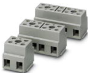
Device terminal block, for direct mounting, 5-pos.

Please be informed that the data shown in this PDF Document is generated from our Online Catalog. Please find the complete data in the user's documentation. Our General Terms of Use for Downloads are valid ( http://phoenixcontact.com/download )