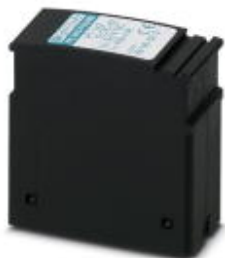
PT protective connector with protective circuit for a 2-wire floating signal circuit. HART-compatible.

Please be informed that the data shown in this PDF Document is generated from our Online Catalog. Please find the complete data in the user's documentation. Our General Terms of Use for Downloads are valid ( http://phoenixcontact.com/download )