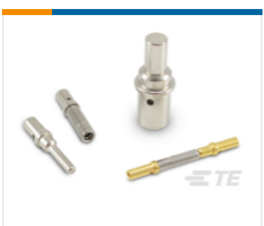
TE Part # CAT-D48-ST273 DEUTSCH Solid Contacts