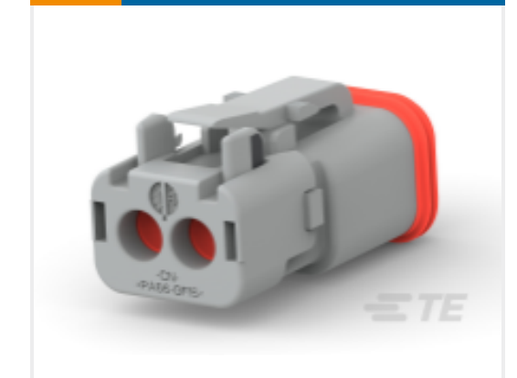
TE Part # CAT-J41-DDPC DEUTSCH DT Plug Connectors