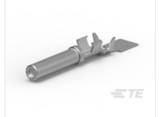
TE Part # CAT-J67-DSCC16 DEUTSCH Size 16 Crimp Contacts