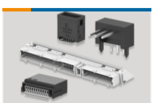
PCB Headers & Receptacles(102)