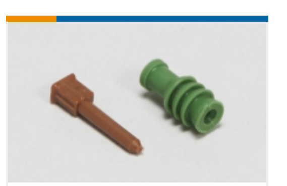
Automotive Seals & Cavity Plugs(5)