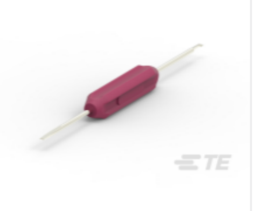
TE Part # DT-RT1 EXT TOOL, FRONT RELEASE