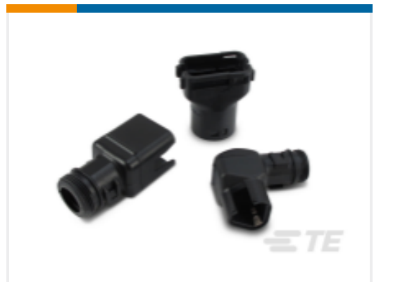
TE Part # CAT-D487-B128 DEUTSCH DT Backshells