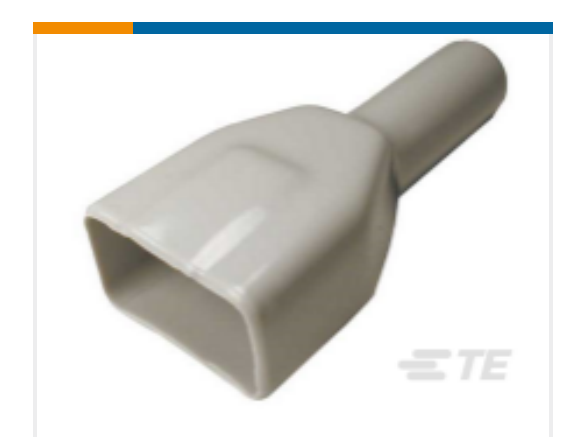
TE Part # DT12P-BT BOOT, 12P, REC, ST, GRY