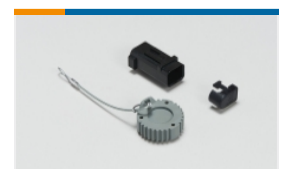
Automotive Connector Caps & Covers (107)