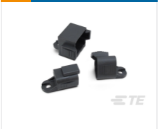
TE Part # CAT-D487-P729 Dust Caps — DEUTSCH DT