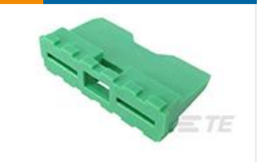
TE Part # W12P WEDGE LOCK, 12P, REC, GRN, DT