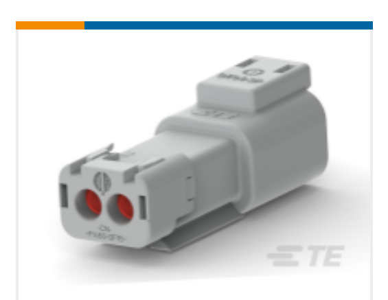
TE Part #DT04-12PA-B016 DEUTSCH DT Receptacle Connectors