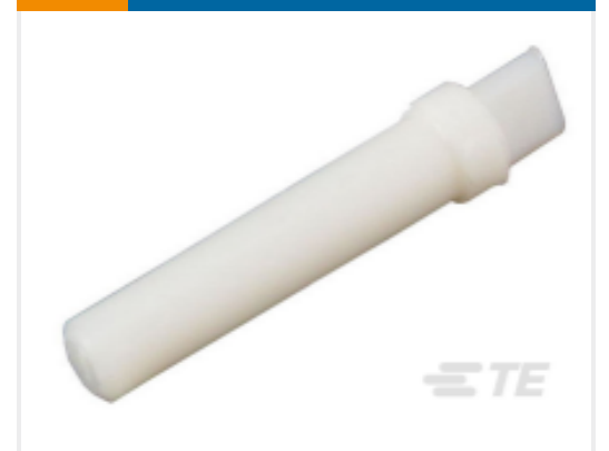
TE Part # 776364-1 SEALING PLUG, SZ 20 CAVITY