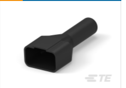
TE Part # DT12P-BT-BK BOOT, 12P, REC, ST, BLK