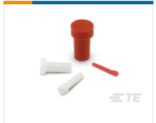
TE Part # CAT-D48-SP729 DEUTSCH Sealing Plugs