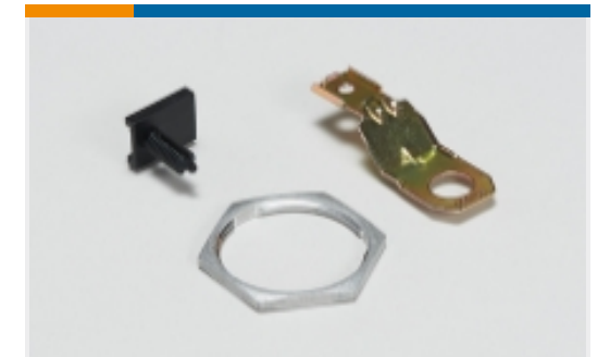
Other Automotive Connector Accessories(16)