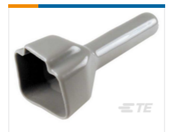
TE Part #DTP4S-BT BOOT, 4P, PLG, ST, GRY