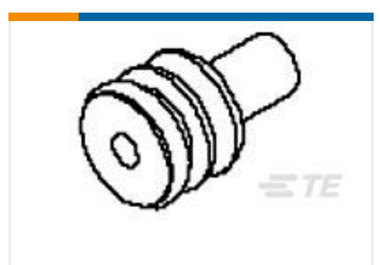
TE Part #638865-1 CABLE SEAL 12 AWG PWR TMR TERM