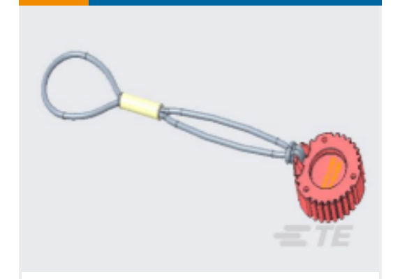
TE Part #HDC9-JDL082397 DUST CAP, 9P, REC, BLK, LANYARD, HD10