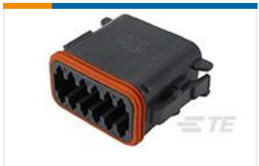
TE Part #DT06-12SA-CE02 PLG, 12P, BLK, E, A