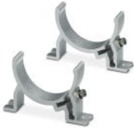
Mounting holder, AlMgSi0,5: Aluminum, for machine lights PLD M 260 .../D70, Swiveling range \pm 30^\circ

Please be informed that the data shown in this PDF Document is generated from our Online Catalog. Please find the complete data in the user's documentation. Our General Terms of Use for Downloads are valid ( http://phoenixcontact.com/download )