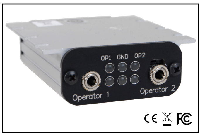
Figure 1. SCS CTC337 Wrist Strap and Ground Monitor