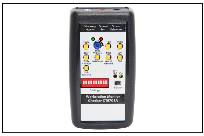
Figure 3. SCS CTE701 Workstation Monitor Checker

The checker verifies the proper operation of dual wrist strap monitoring. Connect a 3.5 mm test cable to both the checker and to the operator jack of the monitor. At this point the monitor should indicate failure. Depress the Pass button on the wrist strap section. The monitor should indicate a good connection. While pressing the Pass button, press body voltage "high." At this point the Wrist Strap LED would be blinking red.