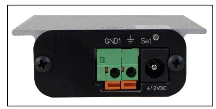
Figure 2. Rear view of Wrist Strap and Ground Monitor

Attach 18 AWG wires to the unit as described below. Strip back the vinyl insulation at each end of the wires to approximately 1/3 inch (8 mm). Twist the stranded wire on each end before inserting the wire into each connector location. In order to attach the wire, insert a small blade screwdriver into the orange slot above. Gently push inward and insert the stripped wire fully into the hole in the green connector. Hold the wire fully in and release the screwdriver to allow the wire to catch. Attach the green monitor ground cord to the ground connector on back of unit. Attach the impedance monitor wire to the "GND1" connector on the back of the unit.