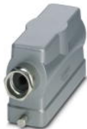
HEAVYCON B24 sleeve housing, for single locking latch, height: 76 mm, with 1 x Pg29 screw connection, lateral cable outlet

Please be informed that the data shown in this PDF Document is generated from our Online Catalog. Please find the complete data in the user's documentation. Our General Terms of Use for Downloads are valid ( http://phoenixcontact.com/download )