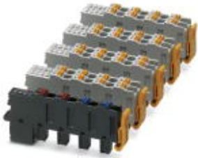
Axioline F connector set (for e.g., AXL F DO32/1 1F)

Please be informed that the data shown in this PDF Document is generated from our Online Catalog. Please find the complete data in the user's documentation. Our General Terms of Use for Downloads are valid ( http://phoenixcontact.com/download )